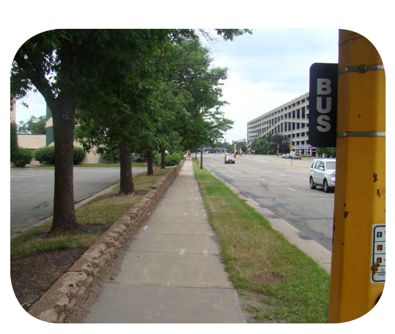
American at Lindau