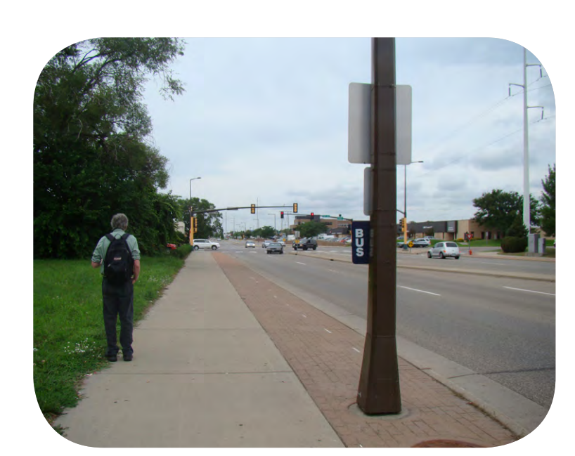
American and Bloomington