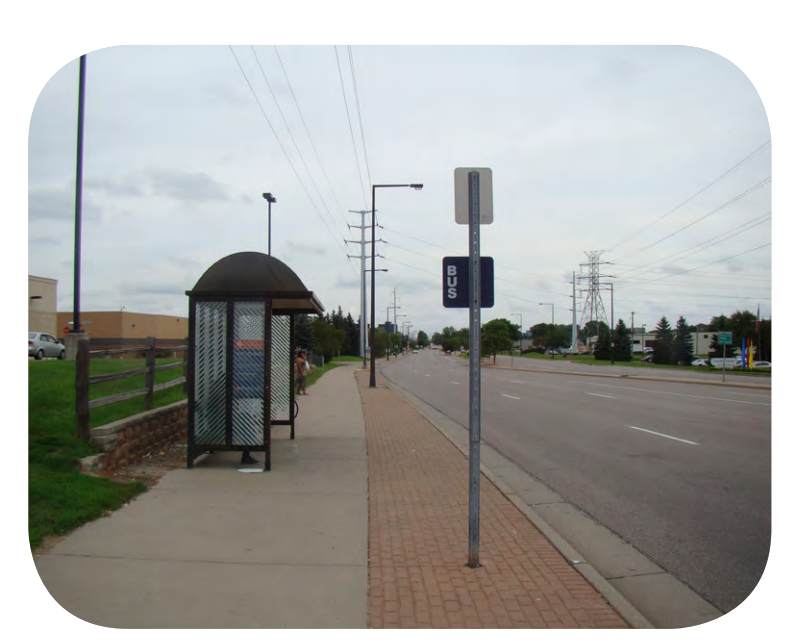
Portland and American