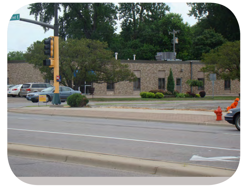
American and 12th