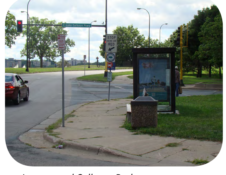
Lagoon and Calhoun Parkway Hennepin and 26th