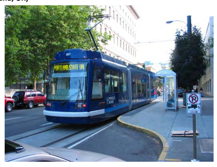
Figure 4. Streetcar (Portland, OR)

A streetcar has higher passenger capacity than a typical bus; however, a streetcar is operationally less flexible than a bus due to fixed rail and power infrastructure. Streetcars require a unique maintenance facility. Capital costs for a streetcar system are higher than capital costs for both Rapid Bus and local bus service, but are lower than those for LRT. Streetcar systems have more restrictive grade, turning, and