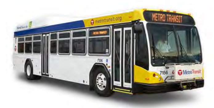
Figure 2. Standard Bus (Metro Transit Low-Floor 40-Foot Hybrid)

A bus is a transit mode comprised of rubber-tired passenger vehicles operating on fixed routes and schedules over various types of roadways. Vehicles are powered by diesel, gasoline, battery, or alternative fuel engines contained within the vehicle. Buses can operate in local, limited-stop, or express service configurations. Local bus service is currently operated in all of the corridors under consideration. Local services stop frequently (8-10 times per mile) on fixed routes to provide access to a wide variety of markets. The level of customer information and facilities provided vary from minimal (e.g., pole in the ground) to substantial (e.g., Transit Center). A typical Metro Transit bus is shown in Figure 2.