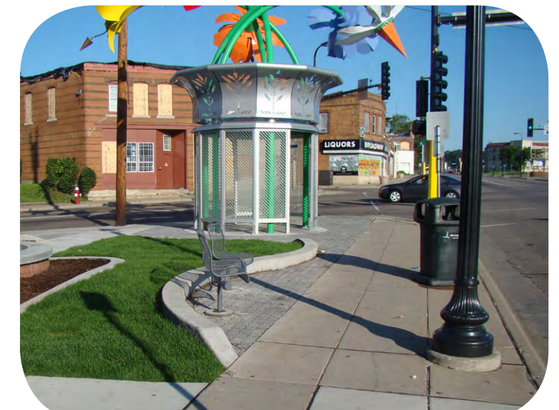
West Broadway and Penn