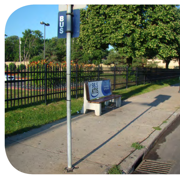
Lyndale and West Broadway