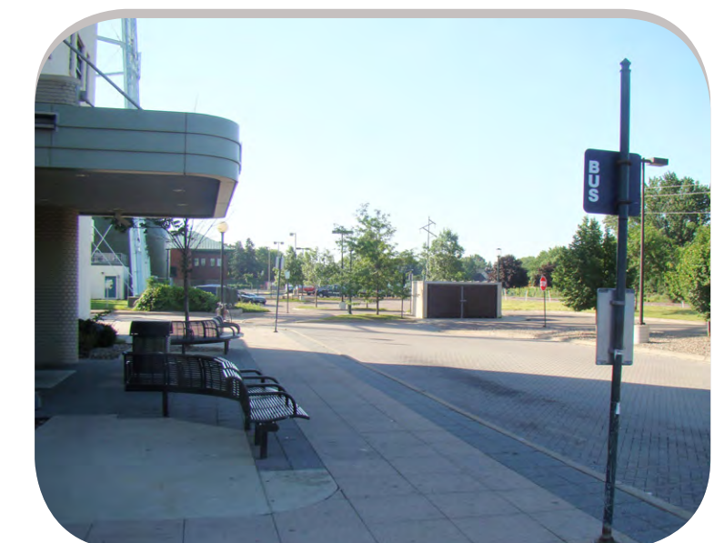
Robbinsdale Transit Center