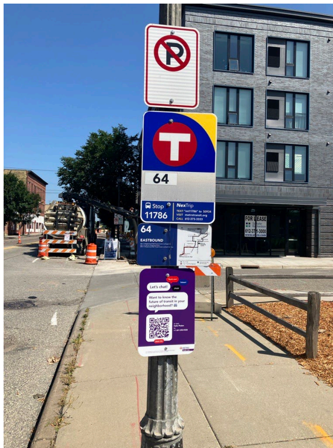
Figure 4: Hello Lamp Post signs at a stop near Payne Ave/Phalen Blvd