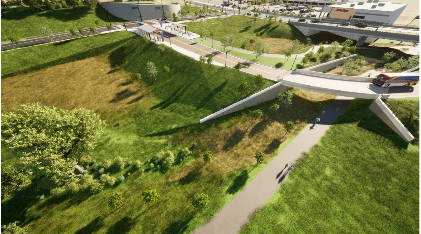
Figure 3: Bird's eye view of Arcade St Station (looking northeast)