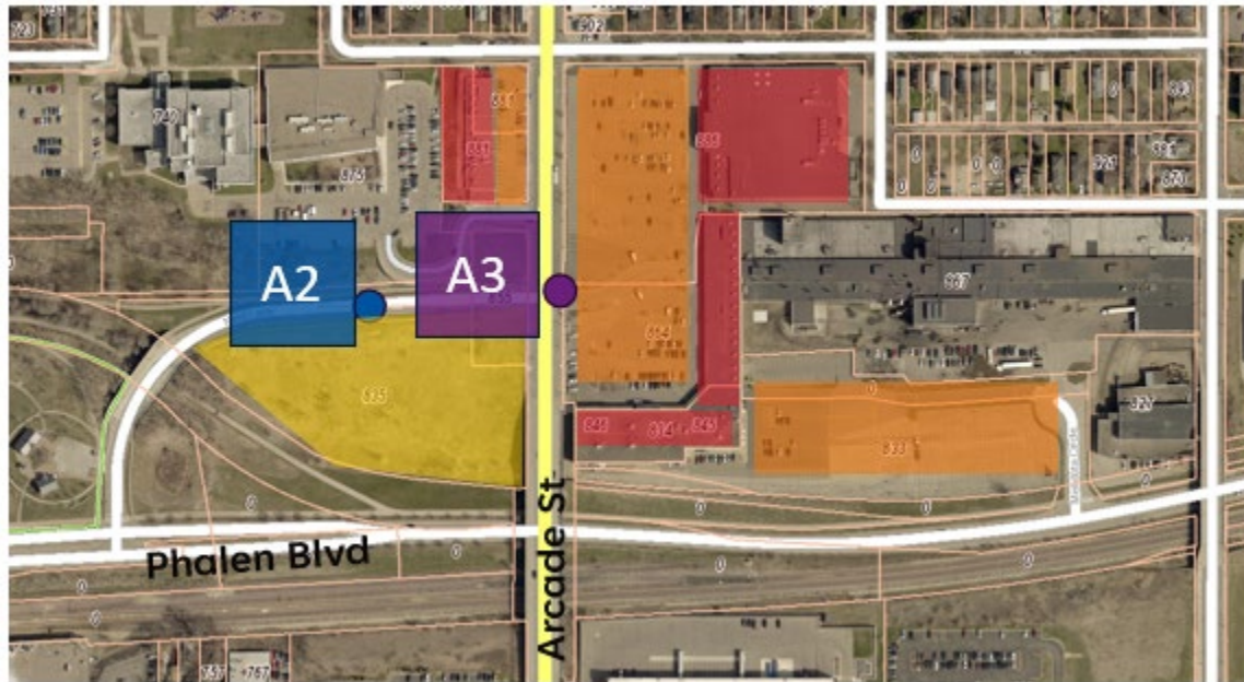
Figure 1: Arcade Street Station Development Scenarios

Each development scenario was analyzed under a range of market conditions, with a spectrum of construction costs, interest rates, and mixes of affordable and market-rate units.