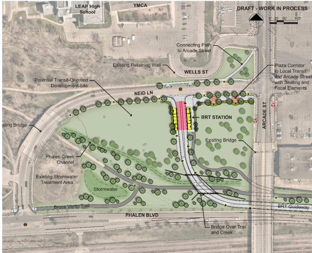
Figure 2: Arcade Street Station Option A2 Design